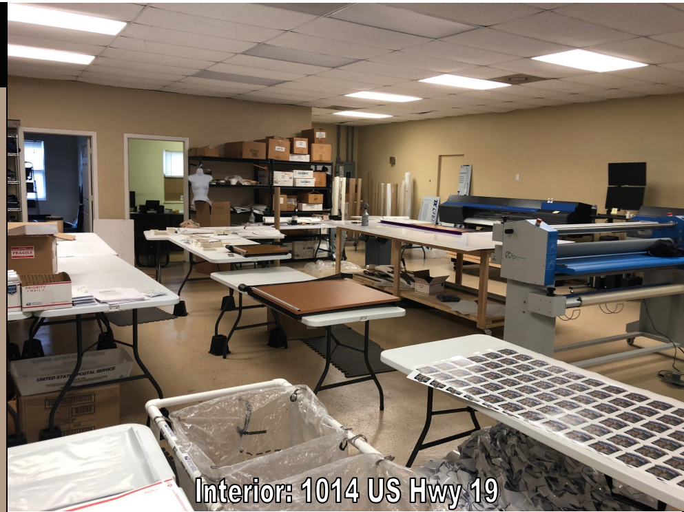
Interior: 1014 US Hwy 19