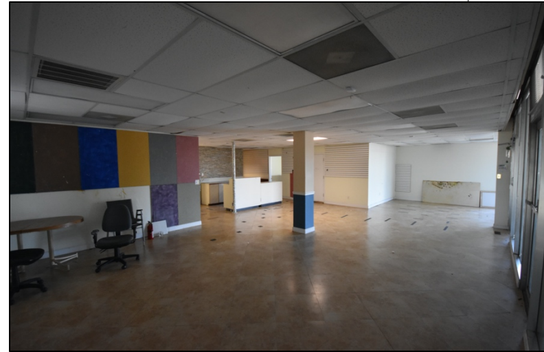
Open Area/Showroom Space