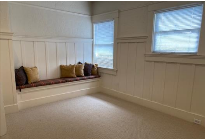
1st FLOOR OFFICE