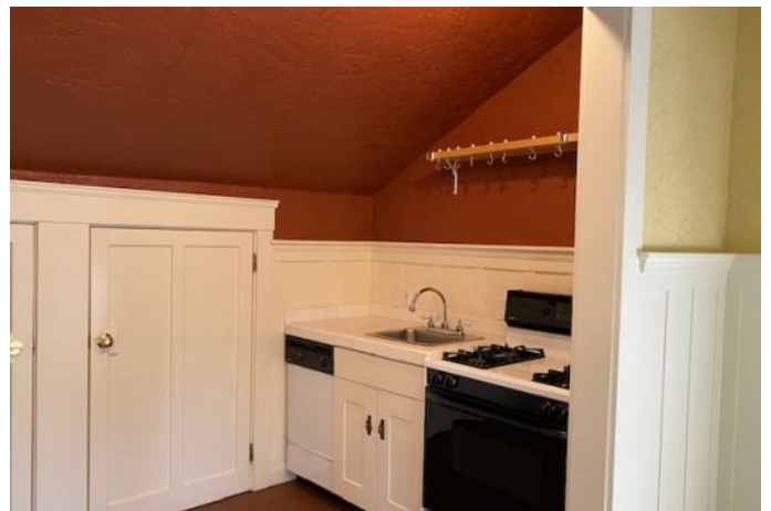
UPSTAIRS LOFT APARTMENT