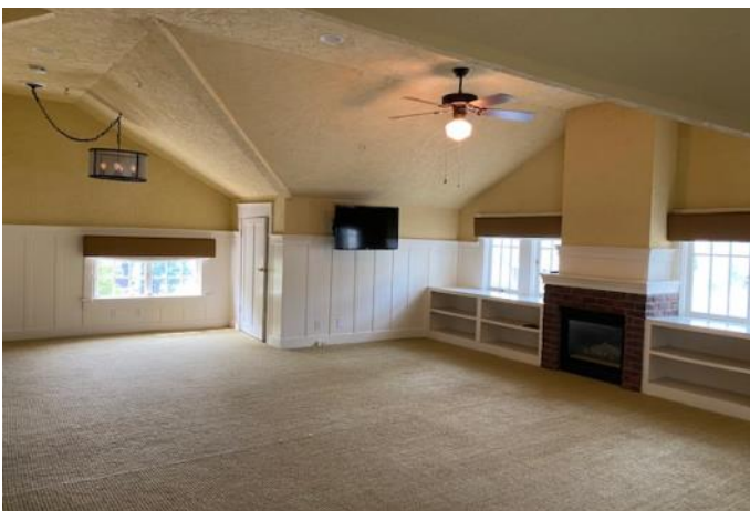
UPSTAIRS LOFT APARTMENT