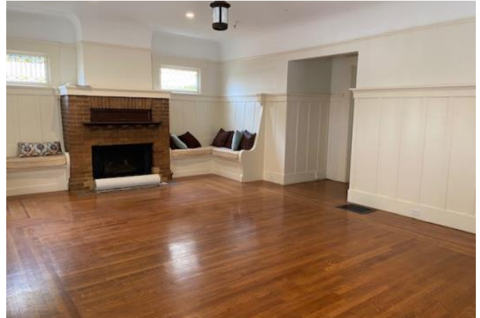
1st FLOOR OFFICE ENTRY/CONFERENCE ROOM