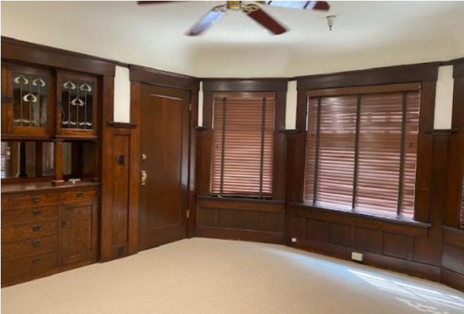
1st FLOOR OFFICE