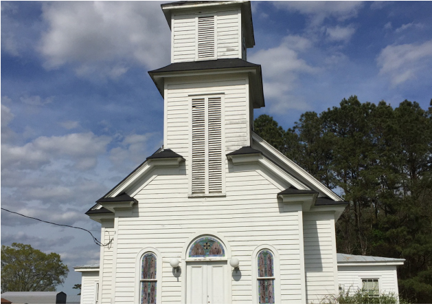
Exterior Front View