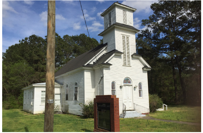
Exterior Side View