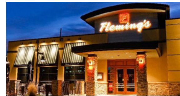
Clockwise: Pita Jungle, Grimaldi's, Snooze, Fleming's, Ra Sushi, Sandbar