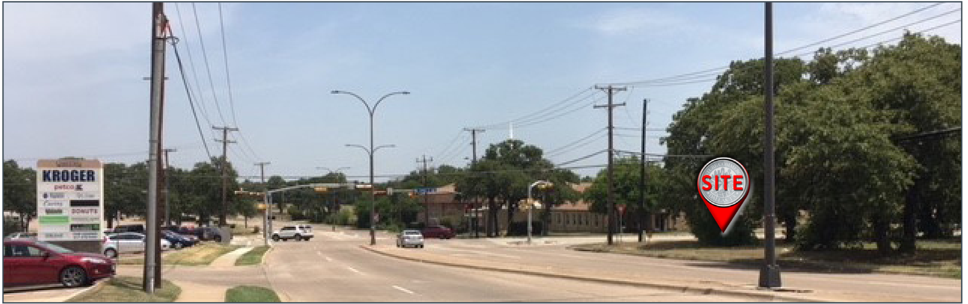
VIEW NORTH OF PROPERTY