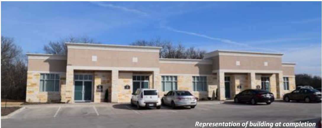
Representation of building at completion