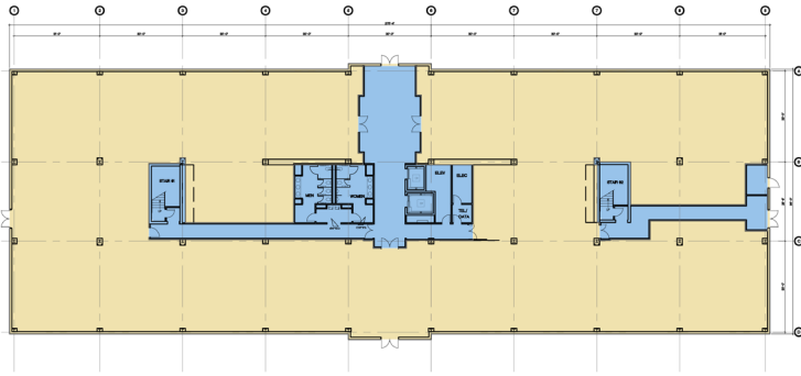
FIRST FLOOR 25,000 SF