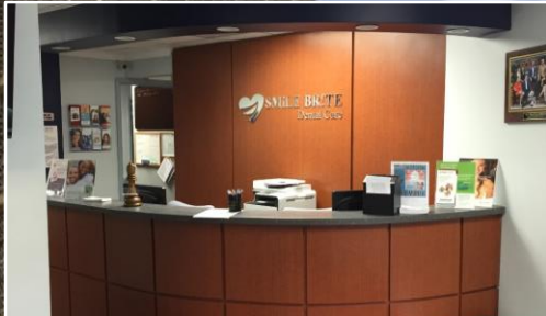
Current Front Desk Area