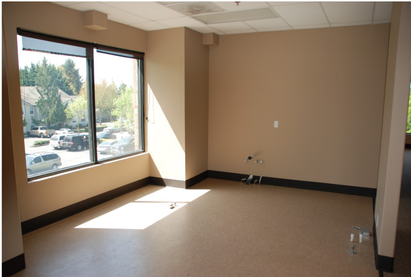
Building 2 - Suite 230—2,497 SF Former Dental