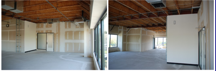
Building 2 - Suite 200—1,782 SF