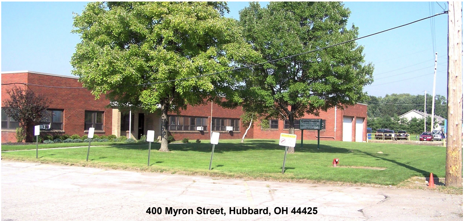
400 Myron Street, Hubbard, OH 44425