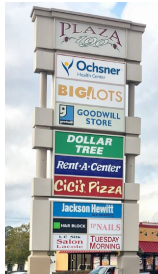
Image Altered to Show Updated Signage