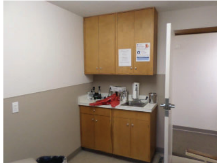
Exam Room 2