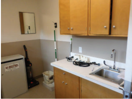
Exam Room 1