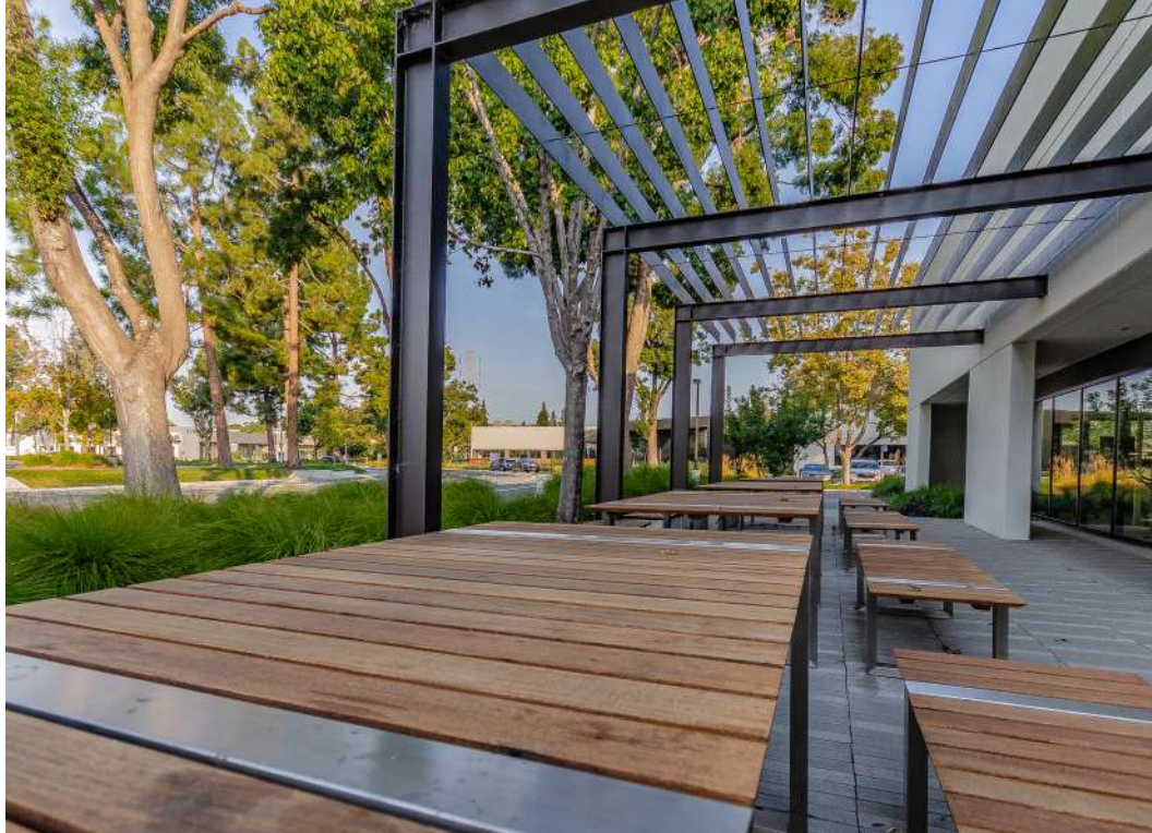
NEWLY RENOVATED OUTDOOR AMENITY AREA