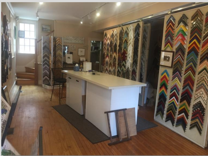
Above: 2 nd Floor Left: First Floor

Fletcher Gill (202) 735-5382 fletchergill@thegenaugroup.com