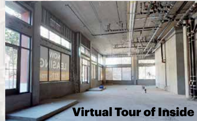
Virtual Tour of Inside