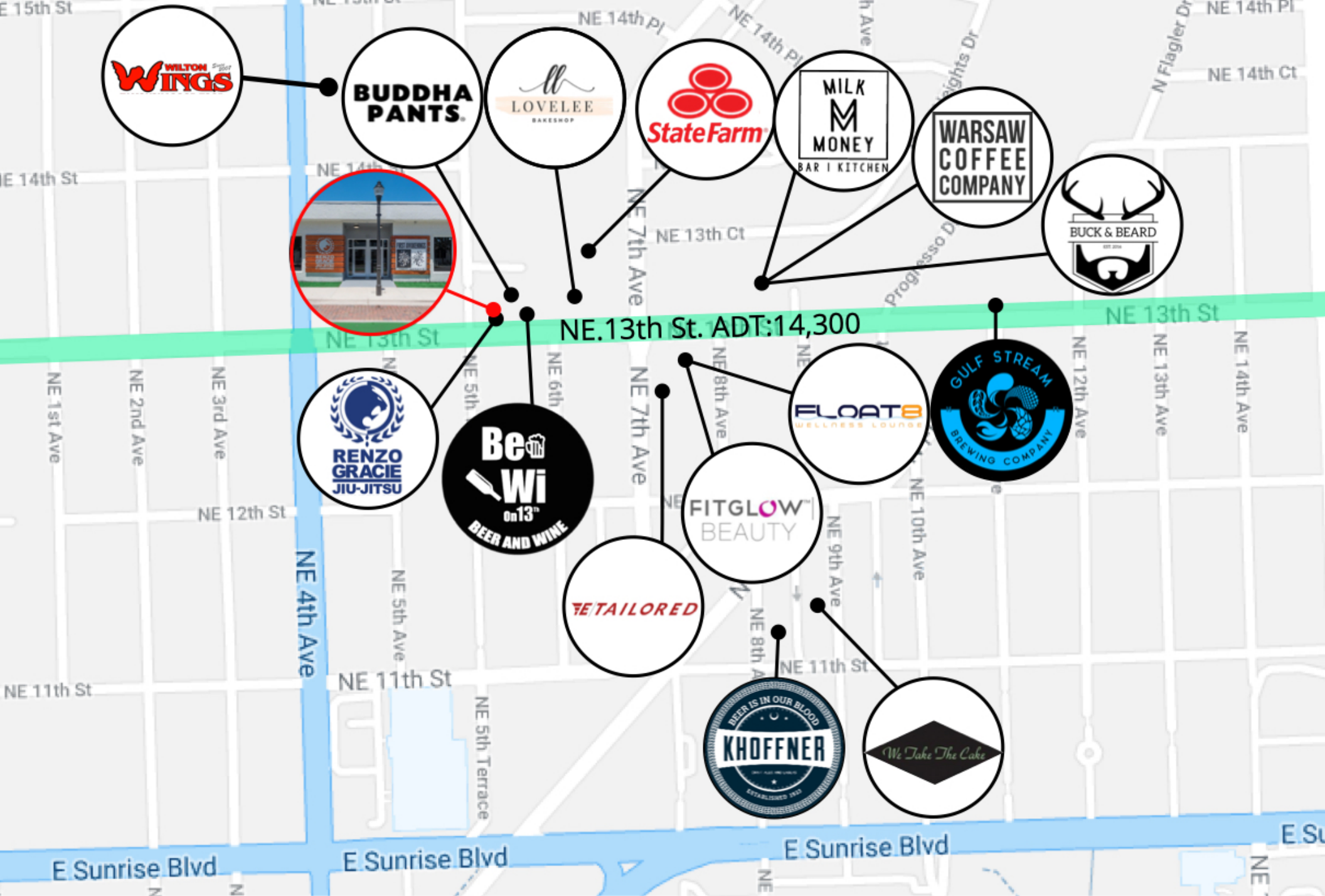
Aerial Map | 535 NE. 13th Street Fort Lauderdale, FL