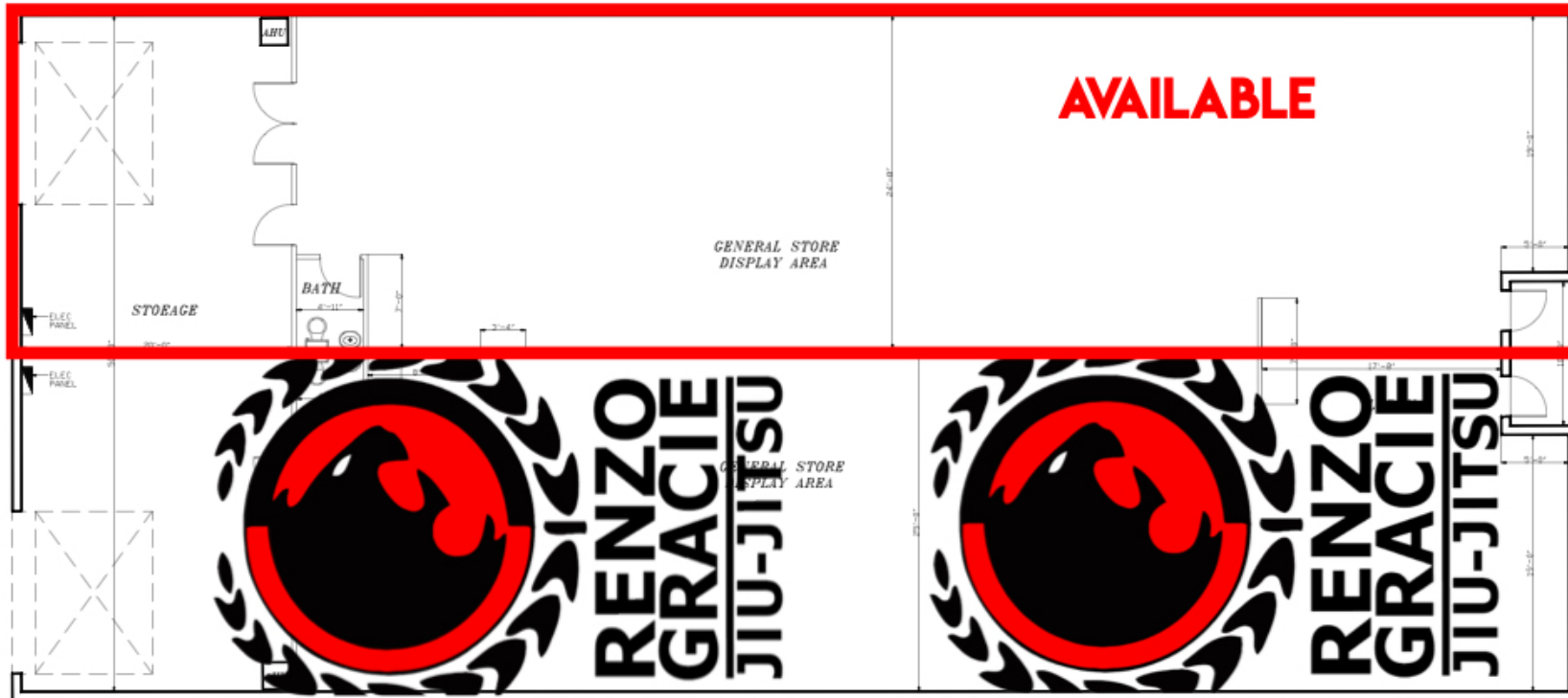
EXISTING FLOOR PLAN SCALE: 1/4"=1'-0"