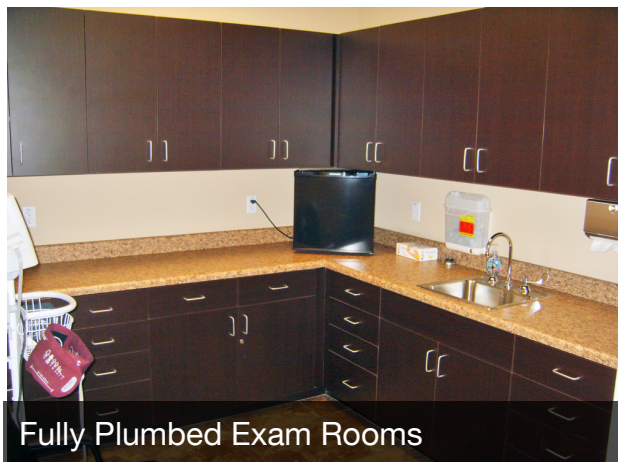
Fully Plumbed Exam Rooms