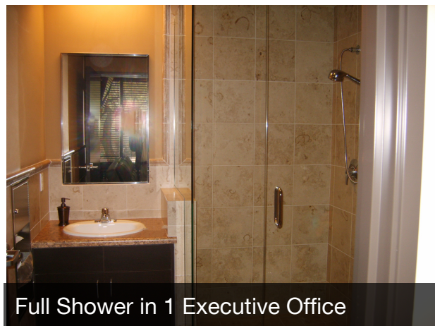
Full Shower in 1 Executive Office