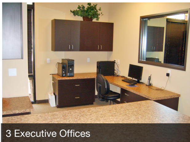
3 Executive Offices