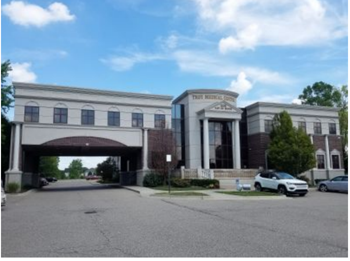
Exterior Photo Exterior Photo