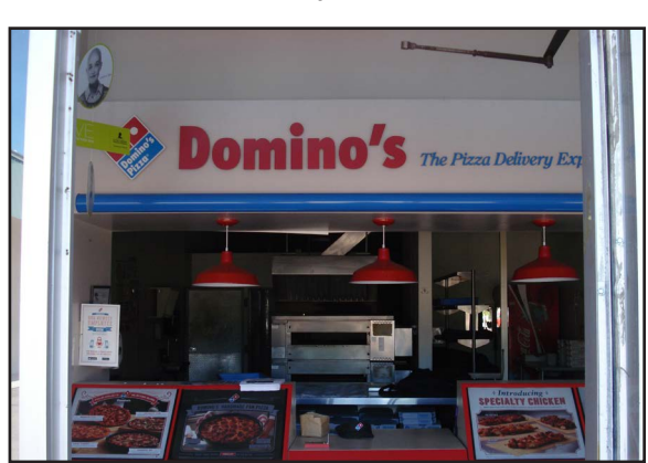
Former Pizza Space