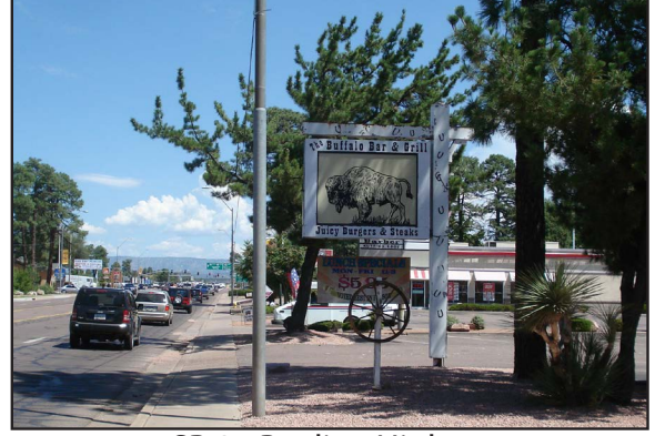
SR 87 Beeline Highway