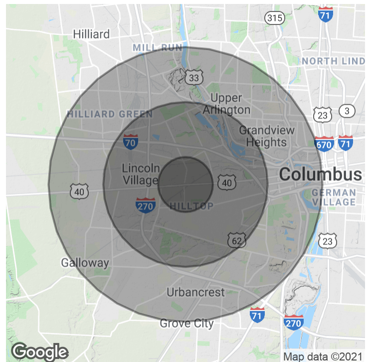
Map data ©2021