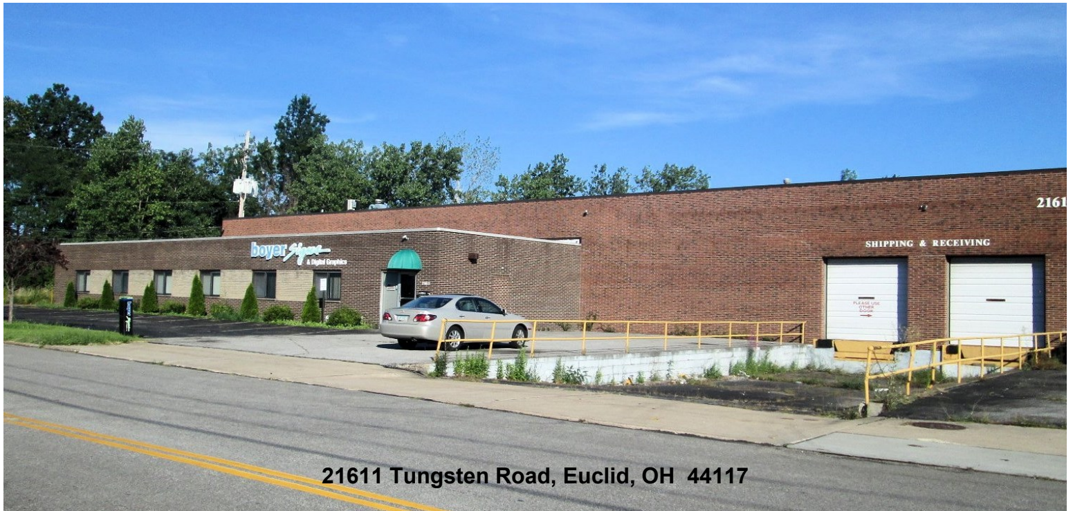
21611 Tungsten Road, Euclid, OH 44117