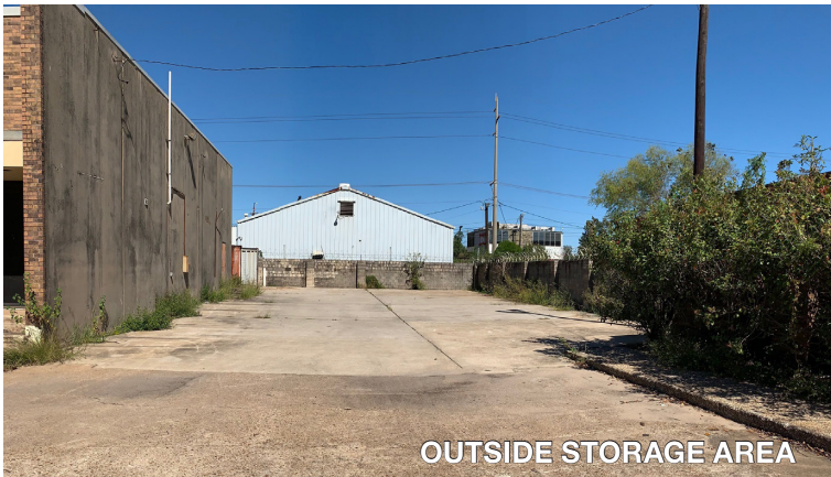
OUTSIDE STORAGE AREA