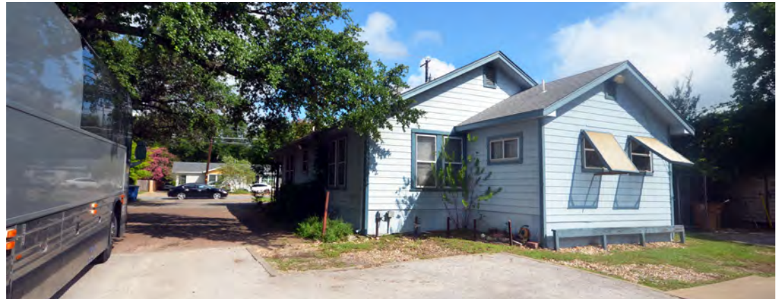
left: studio; right: back of building