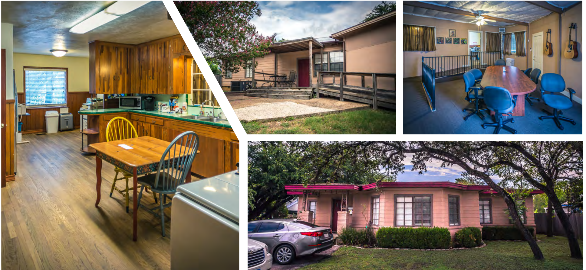
Clockwise from left: Kitchen, back patio, conference room, front of building

4023-4025 MANCHACA ROAD • AUSTIN, TX 78704