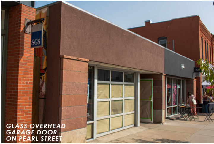
GLASS OVERHEAD GARAGE DOOR ON PEARL STREET