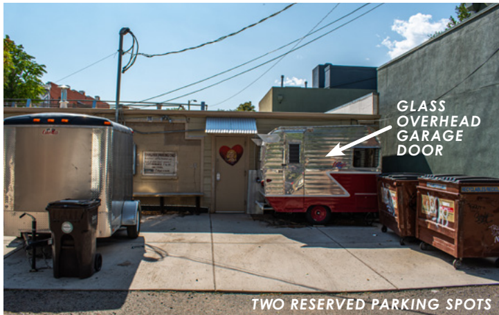
GLASS OVERHEAD GARAGE DOOR