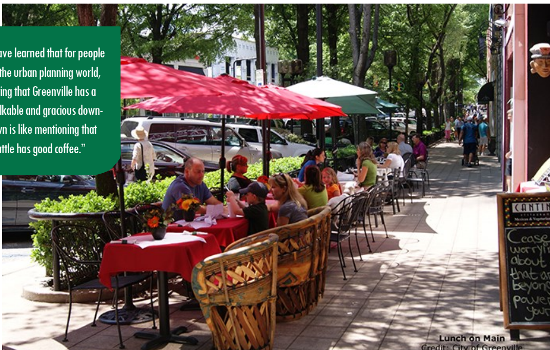
Lunch on Main

I have learned that for people in the urban planning world, noting that Greenville has a walkable and gracious downtown is like mentioning that Seattle has good coffee."