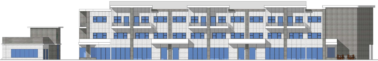
1 VIEW 1 NOT TO SCALE