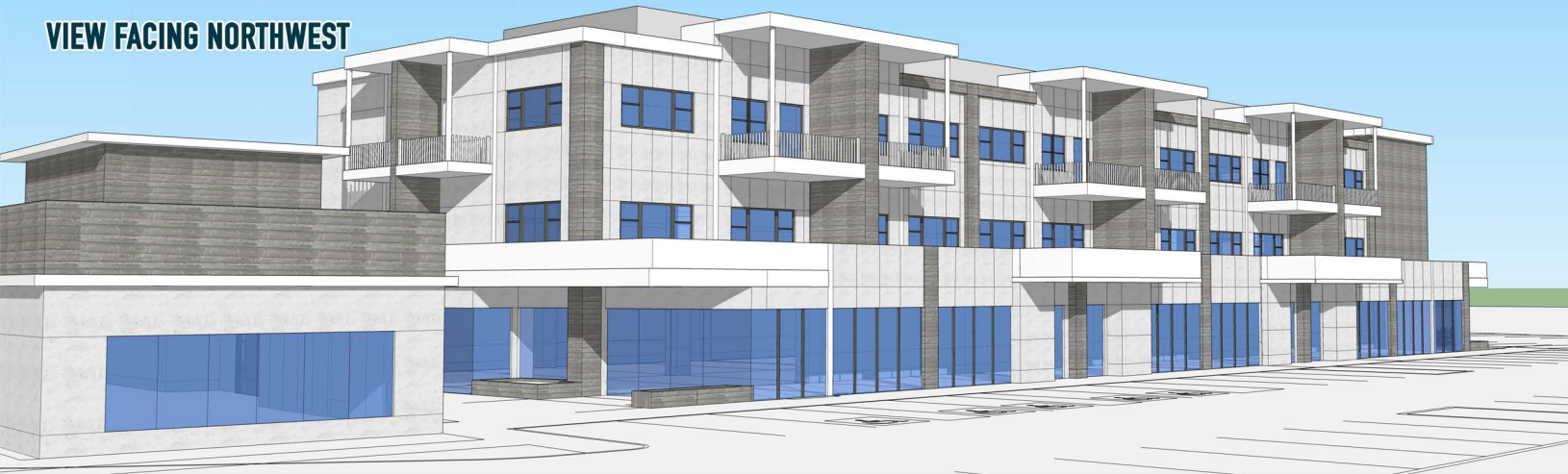
1 VIEW 3 NOT TO SCALE