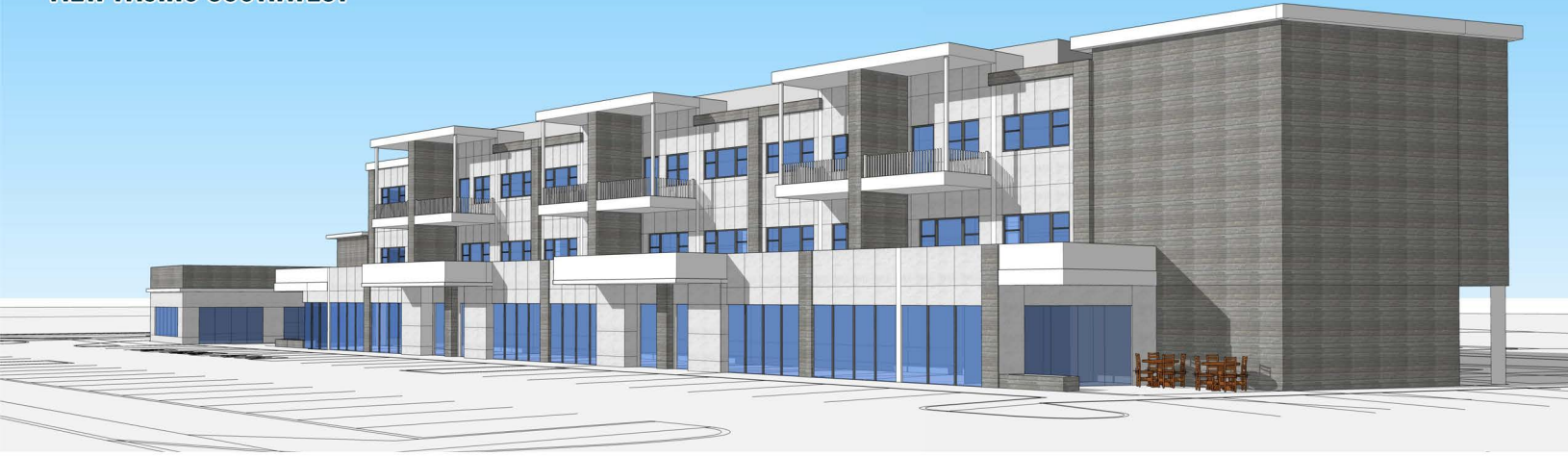
1 VIEW 2 NOT TO SCALE