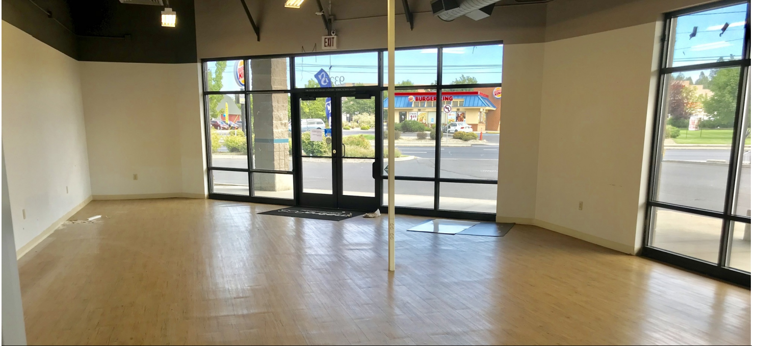
Front of Space Interior