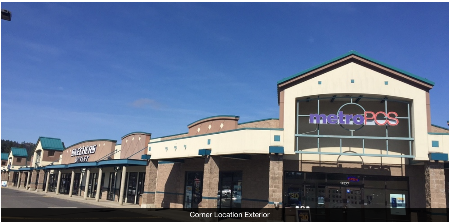
Corner Location Exterior