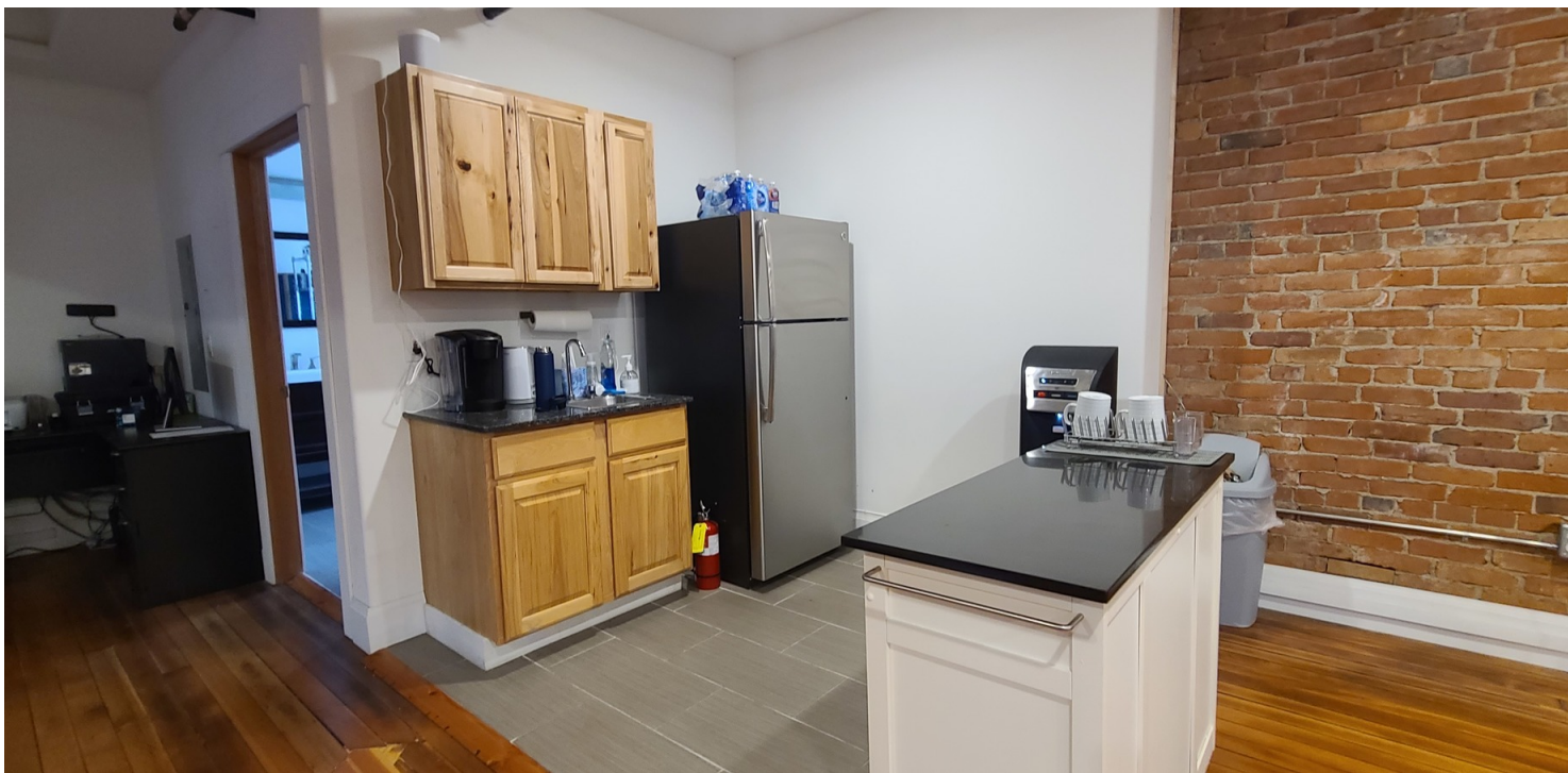
Warranty: Goodale & Barbieri Company does not guarantee, warrant, either expressed or implied, any information supplied by the Seller. Buyer should rely on his own verification of this information as a part of their own due diligence. Copyright: We respect the intellectual property of others. If you believe that your work has been copied in a way that constitutes copyright infringement please contact us immediately.