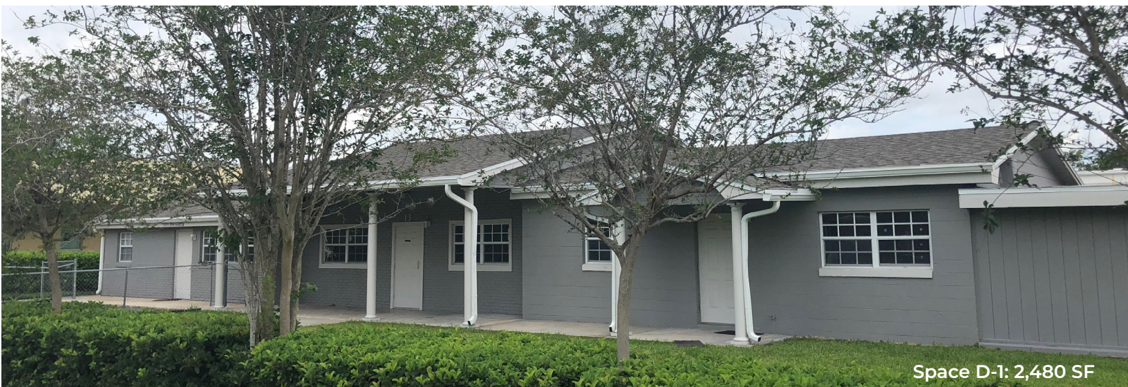
Space D-1: 2,480 SF

PAYTON FOSTER | Payton@FornessProperties.com