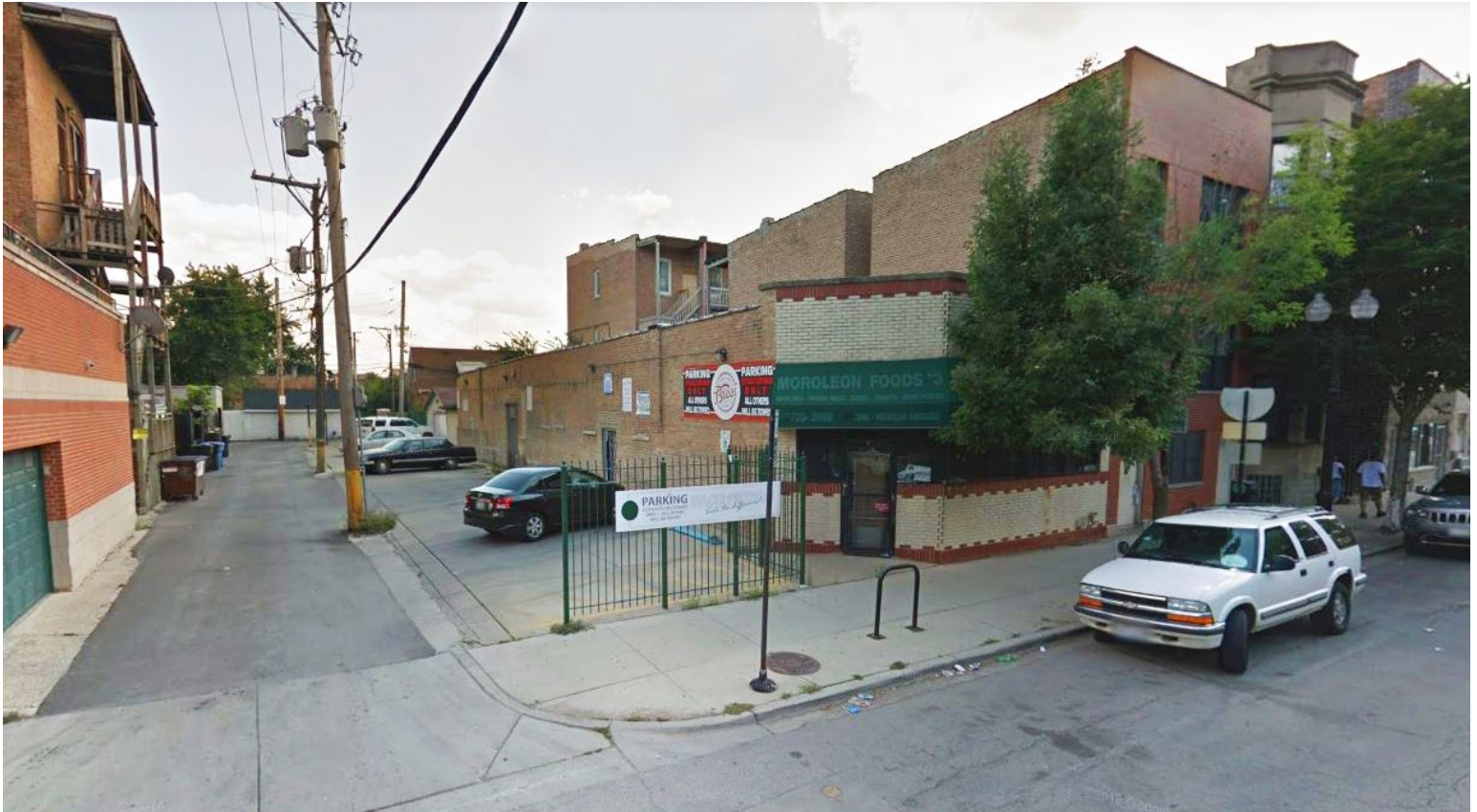
Subject Property Streetview