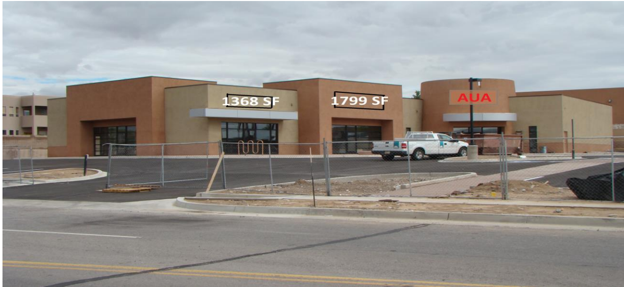
PHASE I PICTURED ABOVE (with ABQ Urology Associates)

4410 Irving Blvd. NW – Near Irving & Eagle Ranch