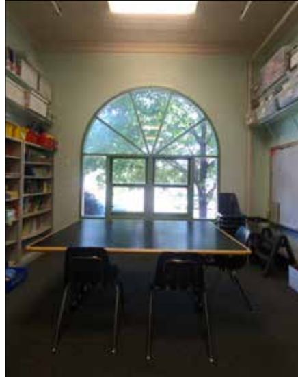
Break Out Room