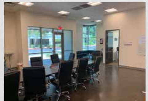
*Furniture not included

Although information has been obtained from sources deemed reliable, neither Owner nor JLL makes any guarantees, warranties or representations, express or implied, as to the completeness or accuracy as to the information contained herein. Any projections, opinions, assumptions or estimates used are for example only. There may be differences between projected and actual results, and those differences may be material. The Property may be withdrawn without notice. Neither Owner nor JLL accepts any liability for any loss or damage suffered by any party resulting from reliance on this information. If the recipient of this information has signed a confidentiality agreement regarding this matter, this information is subject to the terms of that agreement. ©2020 Jones Lang LaSalle IP, Inc. All rights reserved.