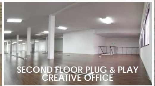
SECOND FLOOR PLUG & PLAY CREATIVE OFFICE