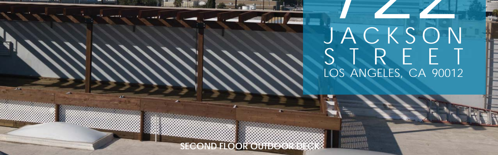
SECOND FLOOR OUTDOOR DECK