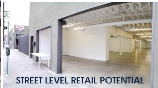
STREET LEVEL RETAIL POTENTIAL