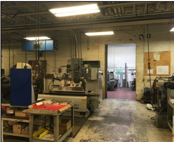
2,112 SF in 13' ceiling height