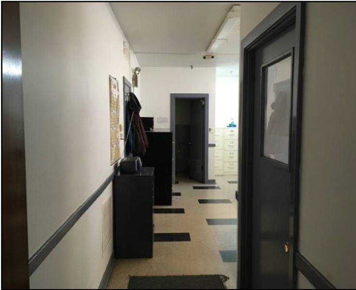
Fully air conditioned office space