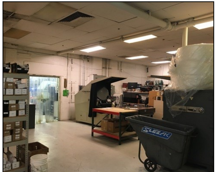
2,640 SF in 11' ceiling height