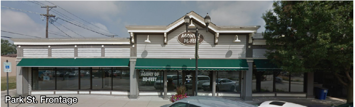
Park St. Frontage