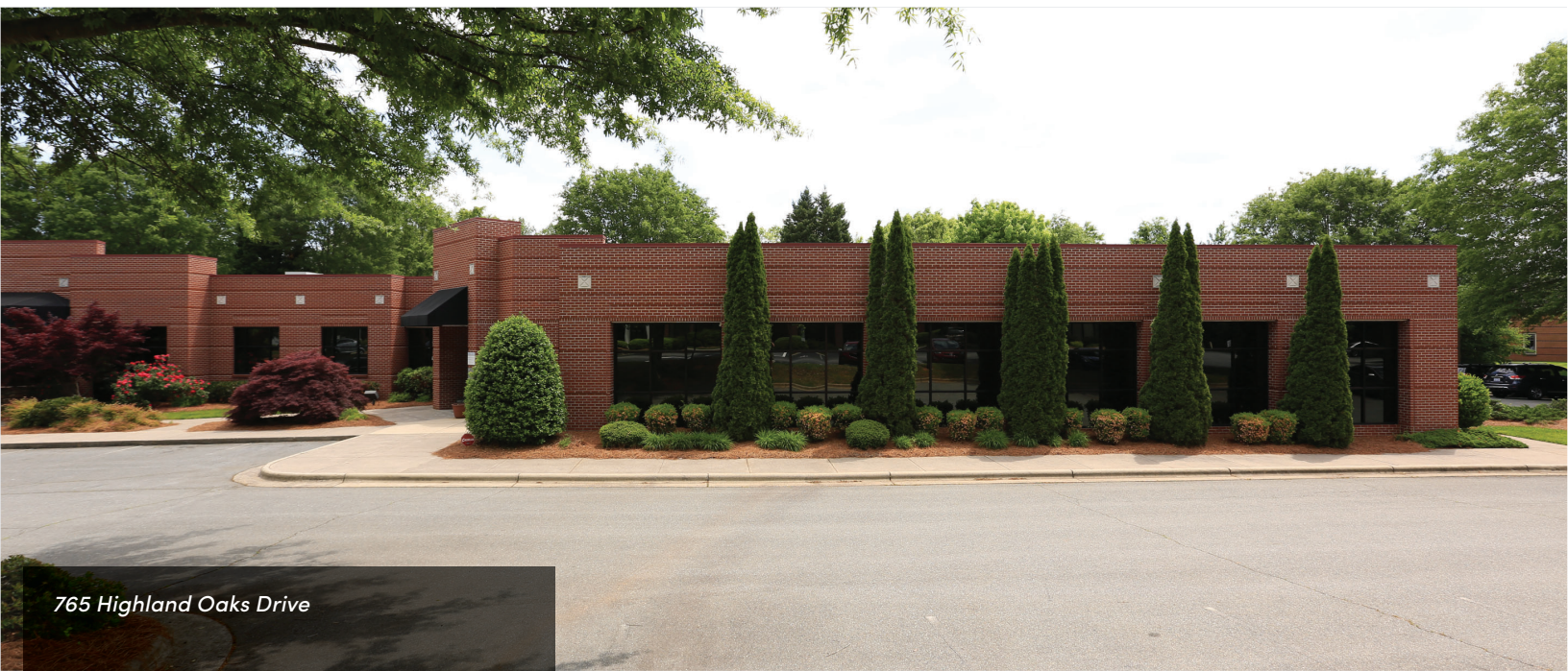
765 Highland Oaks Drive