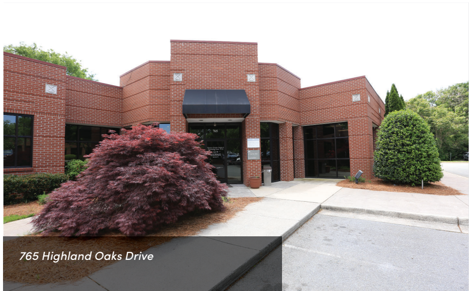
765 Highland Oaks Drive