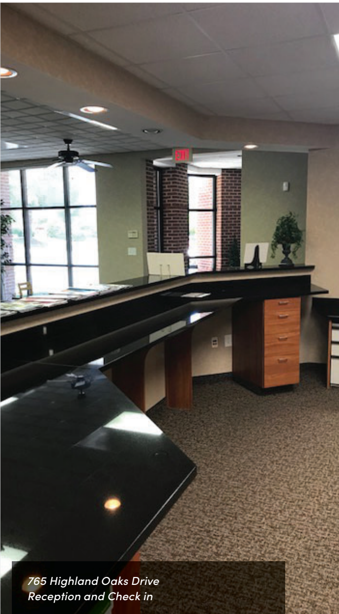
765 Highland Oaks Drive Reception and Check in