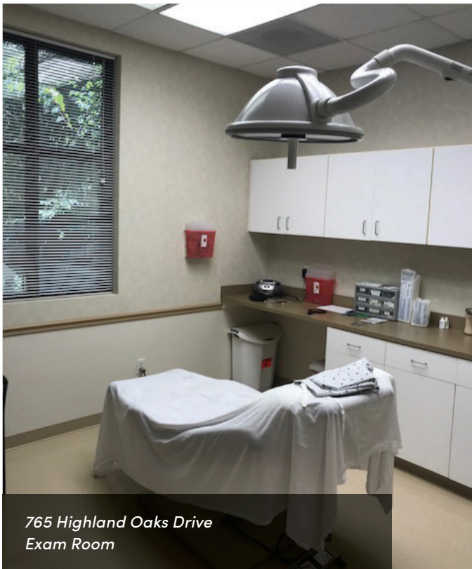
765 Highland Oaks Drive Exam Room