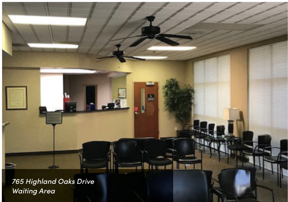
765 Highland Oaks Drive Waiting Area