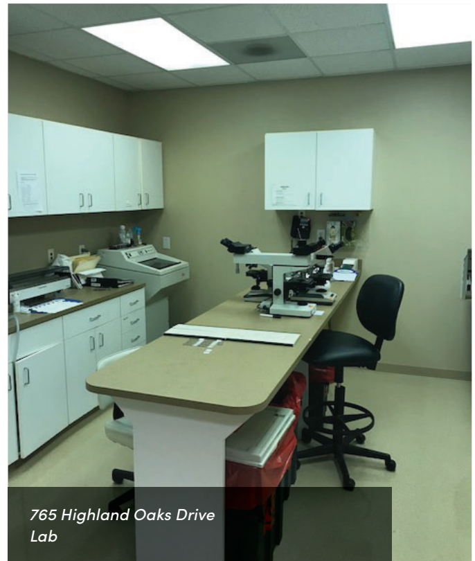
765 Highland Oaks Drive Lab