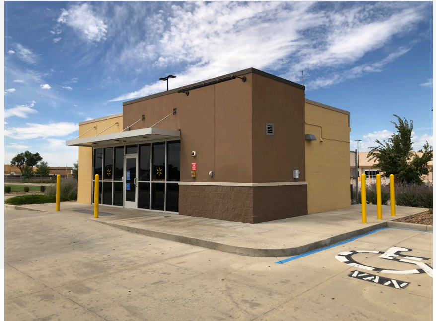
712 N Western Ave | Liberal, KS 67901