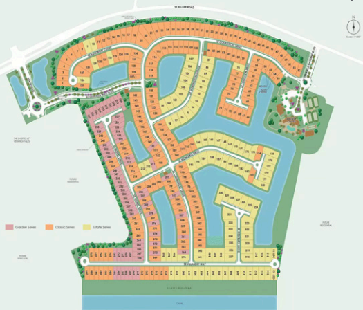
Veranda Gardens West Map

As soon as you arrive at Veranda Gardens, you are home. Located in Port St. Lucie, east of Florida's Turnpike, the community features a gated entry, natural gas, and community amenities including a heated resort-style pool, fire pit, dog park and sports courts. Our collection of single-family homes offer lake and preserve views with open floor plans and a low-maintenance lifestyle where you can relax and spend more time enjoying the things you love.