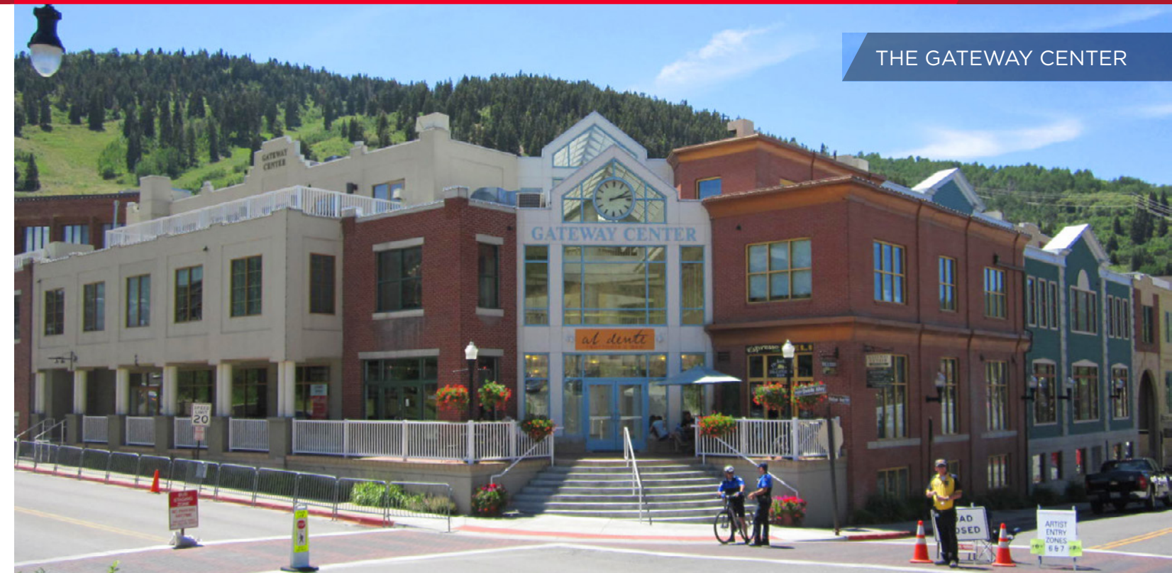
THE GATEWAY CENTER

Retail space available in the Gateway Center.