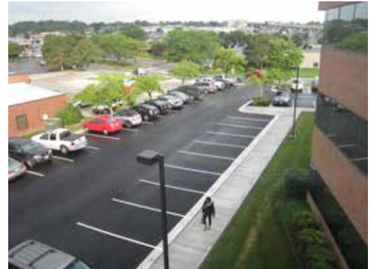
NEW PARKING LOT/SIDEWALK