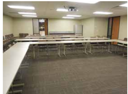
COMMON AREA TRAINING ROOM - SEATS UP TO 60 PEOPLE