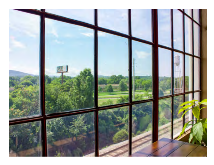
Several suites offer excellent views of Monte Sano Mountain, Downtown Huntsville, and new outdoor campus courtyard.

Property has an on-site fitness center with restrooms/showers as part of the development, as well as two membership-based gyms: Irontribe & Three15 Studio.