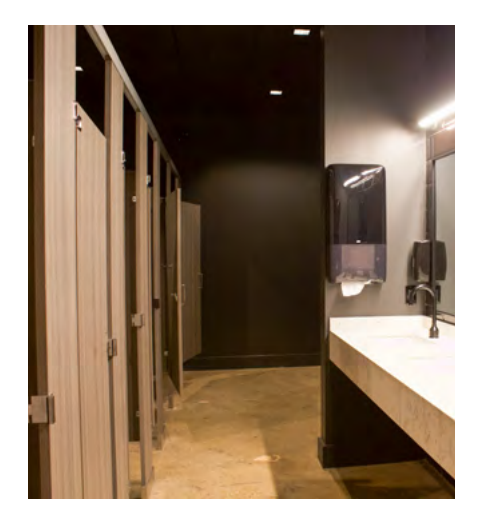
Fully renovated restrooms.