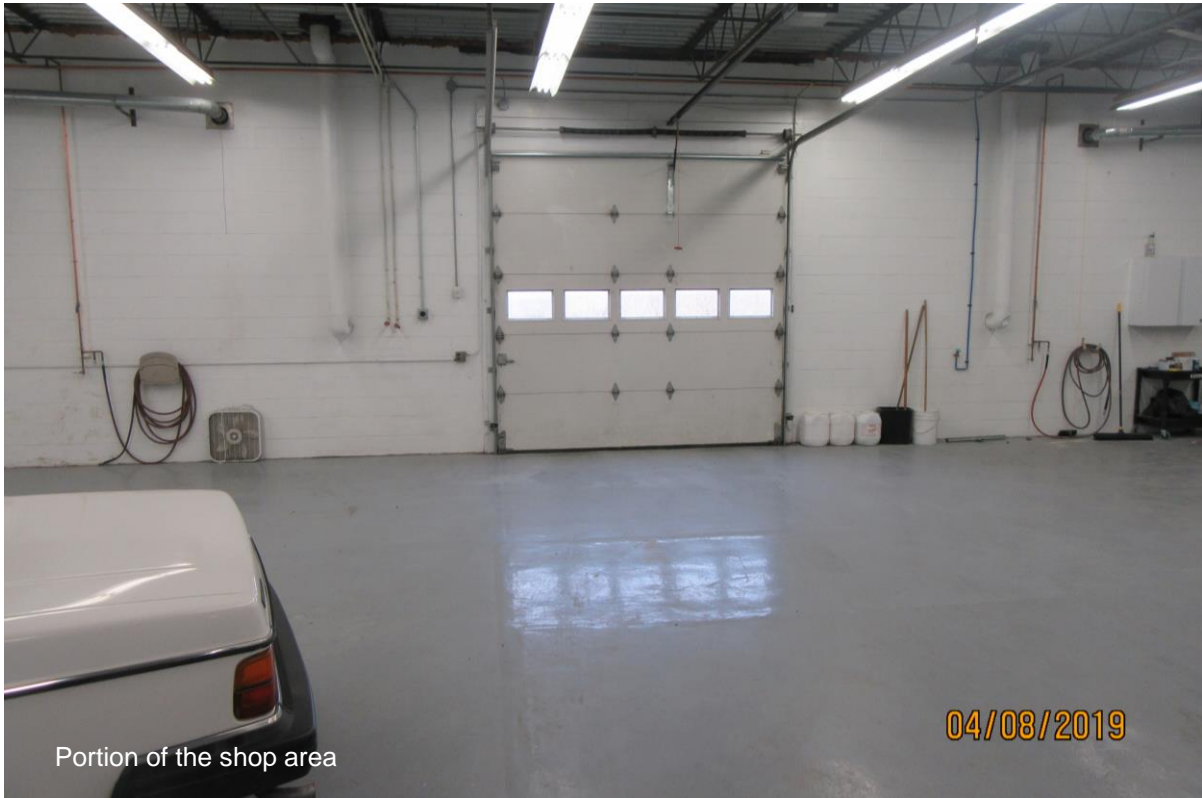
Portion of the shop area