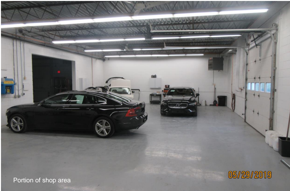
Completely renovated in 2016