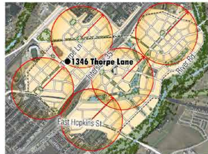
ILLUSTRATIVE PLAN AND 5-MINUTE WALKING CIRCLES

Midtown will be a high-density mixed use area, possibly the densest area in San Marcos, with a network of interconnected streets making the area pedestrian and bike friendly. Midtown residents will have easy access to services, city facilities, the university, and the San Marcos River, and future trails along the Blanco River. They will have the most diverse options for transportation, including transit connections to the university and the rest of the city. A variety of services will be within walking distance, along the multiple bicycle routes, and through vehicular access