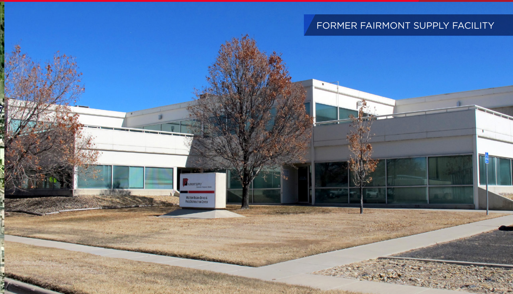
FORMER FAIRMONT SUPPLY FACILITY

37,900 SF Industrial building on 3.67 acres, concrete tilt up construction 28,600 SF warehouse, 9,300 SF office on 2 levels, 26' clear height in warehouse, T-8 lighting