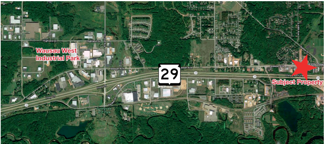
Map of Businesses West of Subject Property