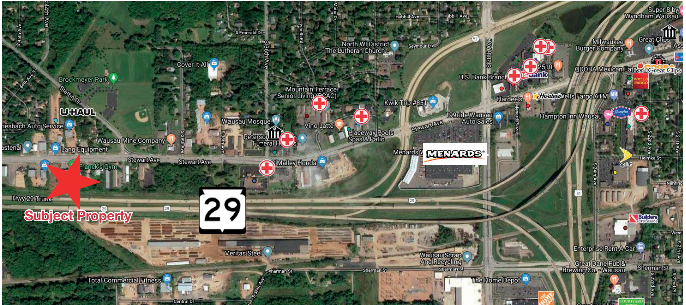
Map of Businesses East of Subject Property