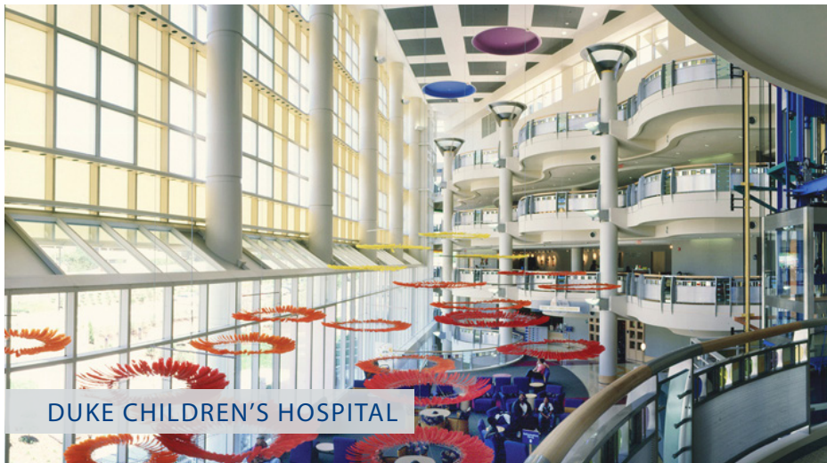
DUKE CHILDREN'S HOSPITAL

One of the top 10 U.S. hospitals according to U.S. News & World Report