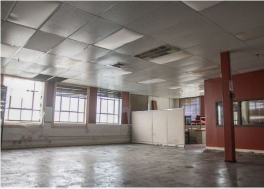
2nd Floor Office Space