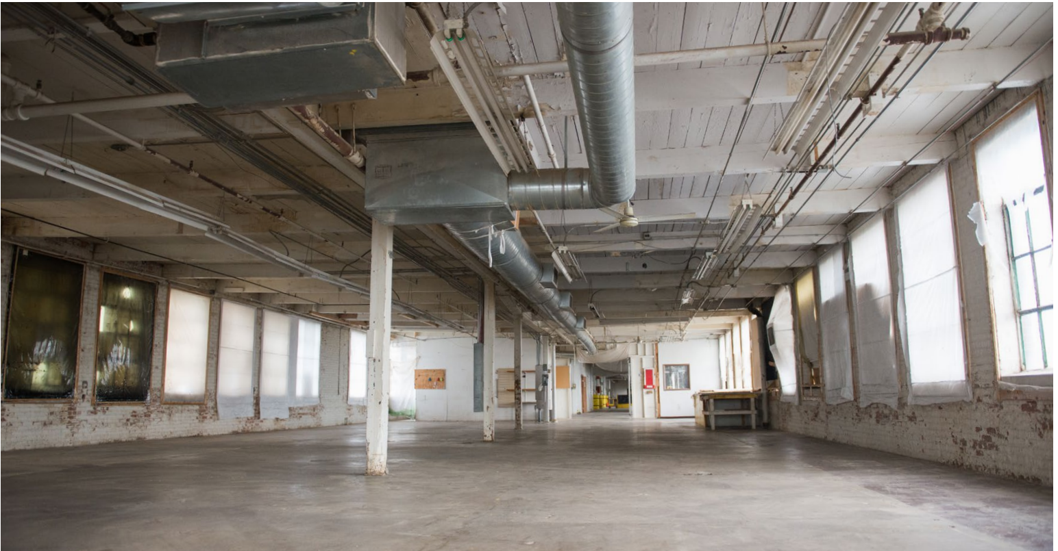
2nd Floor Warehouse Interior