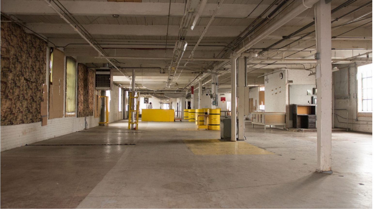
Property Warehouse Interior