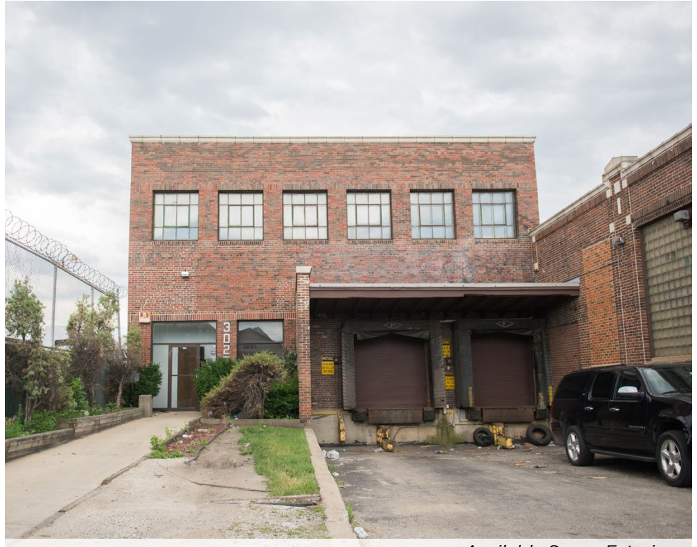
Available Space Exterior