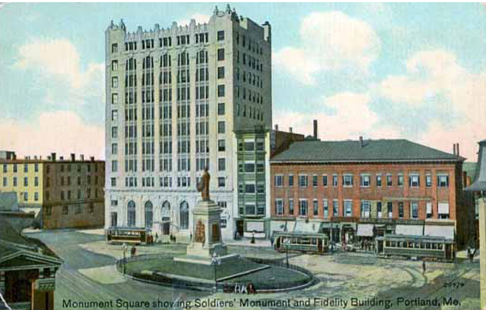
Monument Square showing Soldiers' Monument and Fidelity Building, Portland, Me.

The Fidelity Trust Company building was built in 1910 and designed by well-known Boston architect G. Henri Desmond, his largest and most prominent work at the time. When it was completed The Fidelity building was one of New England's premier skyscrapers and the tallest building in Maine. Designed in the Gothic Beaux-Arts style, this building changed Portland's skyline and helped cement Portland as Maine's economic epicenter. At the time of its completion The Fidelity Building opened to great fanfare and still to this day is an important visual anchor on Monument Square. Listed as an historic Portland Landmark, this building has been cherished for over 100 years from visitors and Portlanders alike.